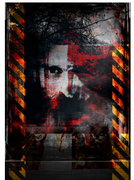
Figure 2: not finished

Questioning society can also be a way of adapting to it. What should we do when we see a negative aspect of this life that we want to live to the fullest?