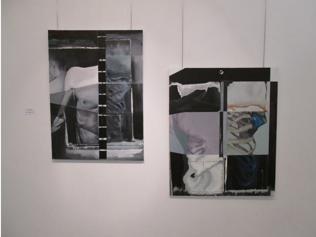
Figure 1: " İsimsiz Serisinden ", (2013), Oil on canvas